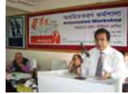
^v''Mõgt I qvm cwi exyY tciyZ Kvhpctgi AeinZKiY KgRuj v